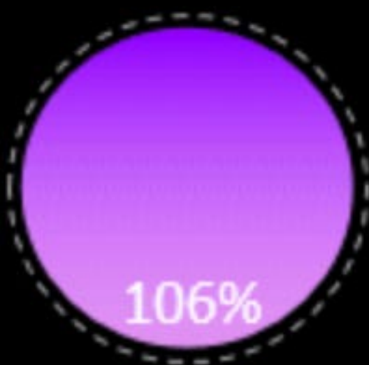
SALES PLAN IN $