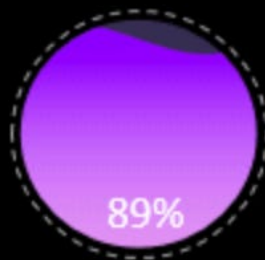
NEW CLIENTS PLAN