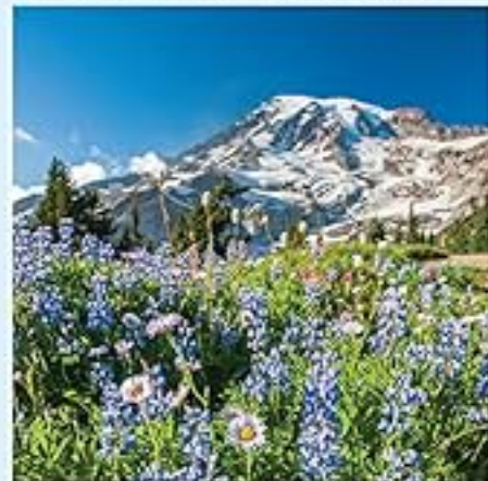
Mount Rainier National Park (WA)