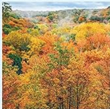
Cuyahoga Valley National Park (OH)