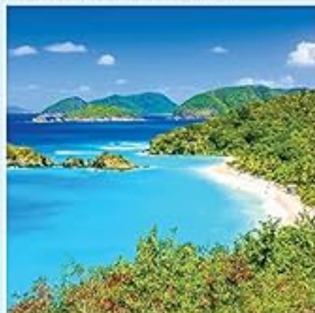
Virgin Islands National Park (USVI)

Calendar of the OFFICIAL CHARITY of America's National Parks