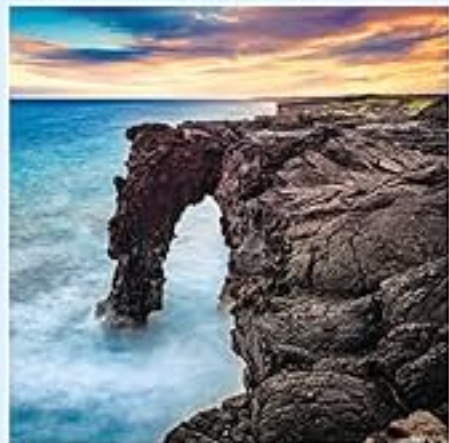
Hawai'i Volcanoes National Park (HI)