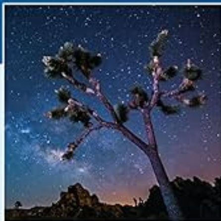
Joshua Tree National Park (CA)