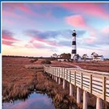
Cape Hatteras National Seashore (NC)