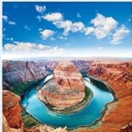
Glen Canyon National Recreation Area (AZ, UT)