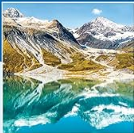
Glacier Bay National Park & Preserve (AK)

Front cover image features Yellowstone National Park (ID, MT, WY).