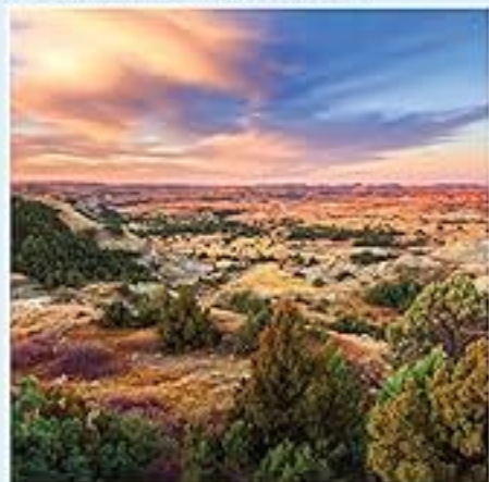
Theodore Roosevelt National Park (ND)