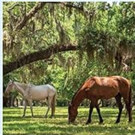
Cumberland Island National Seashore (GA)