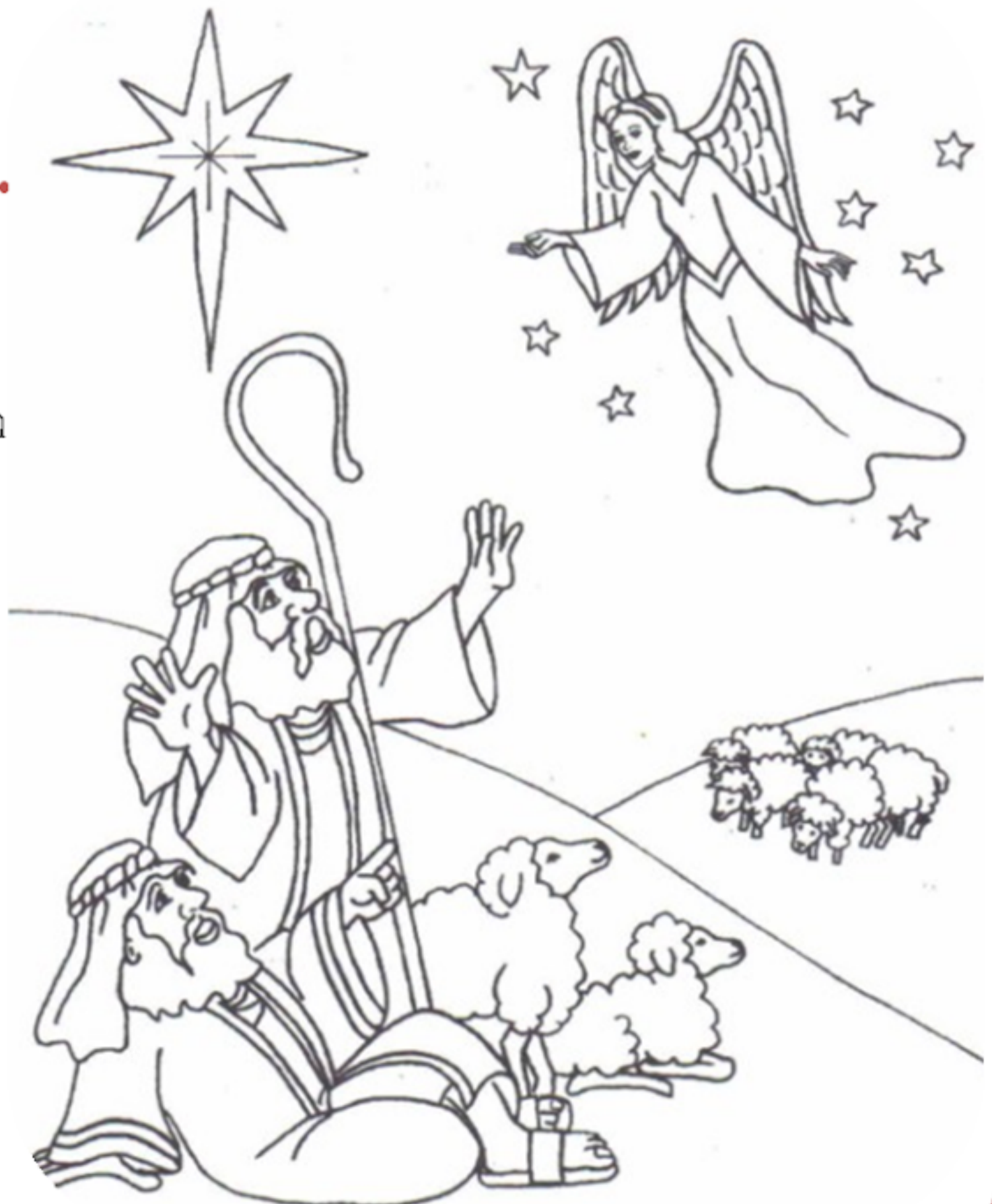
An angel of the Lord appeared to them and said, "Don't be afraid. I bring good news!"

This is the third week of Advent and when we learn about Joy. We have so much happiness in our hearts because Jesus came to love us and save us. When babies are born people are so excited to share the news. The shepherds had the best news to tell people, that Christ had been born in Bethlehem. Christmas is a wonderful time to tell others about Jesus. If you have a manger scene at your house, pull out the animals and shepherds who came to see Jesus and then went and told others.