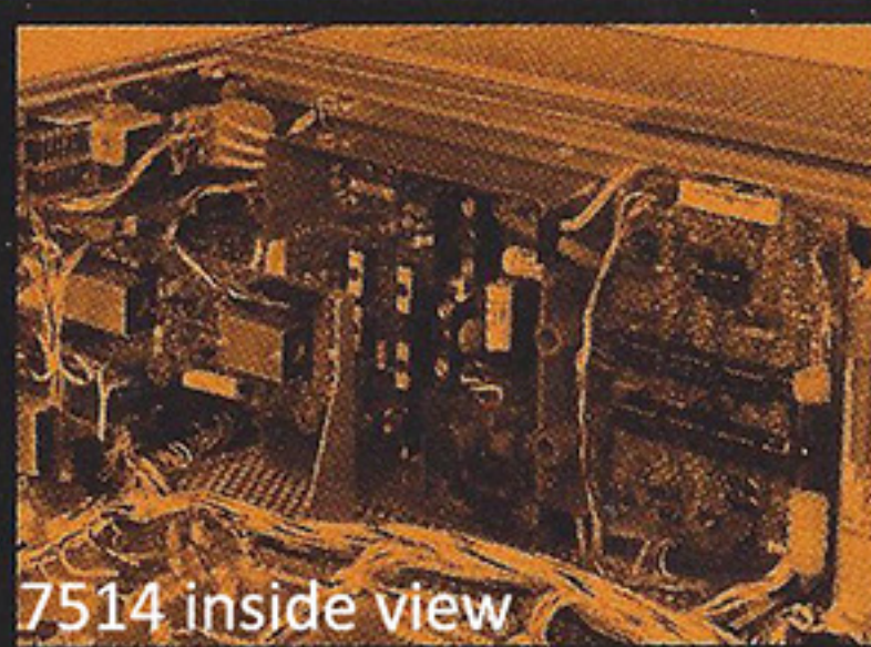
7514 inside view