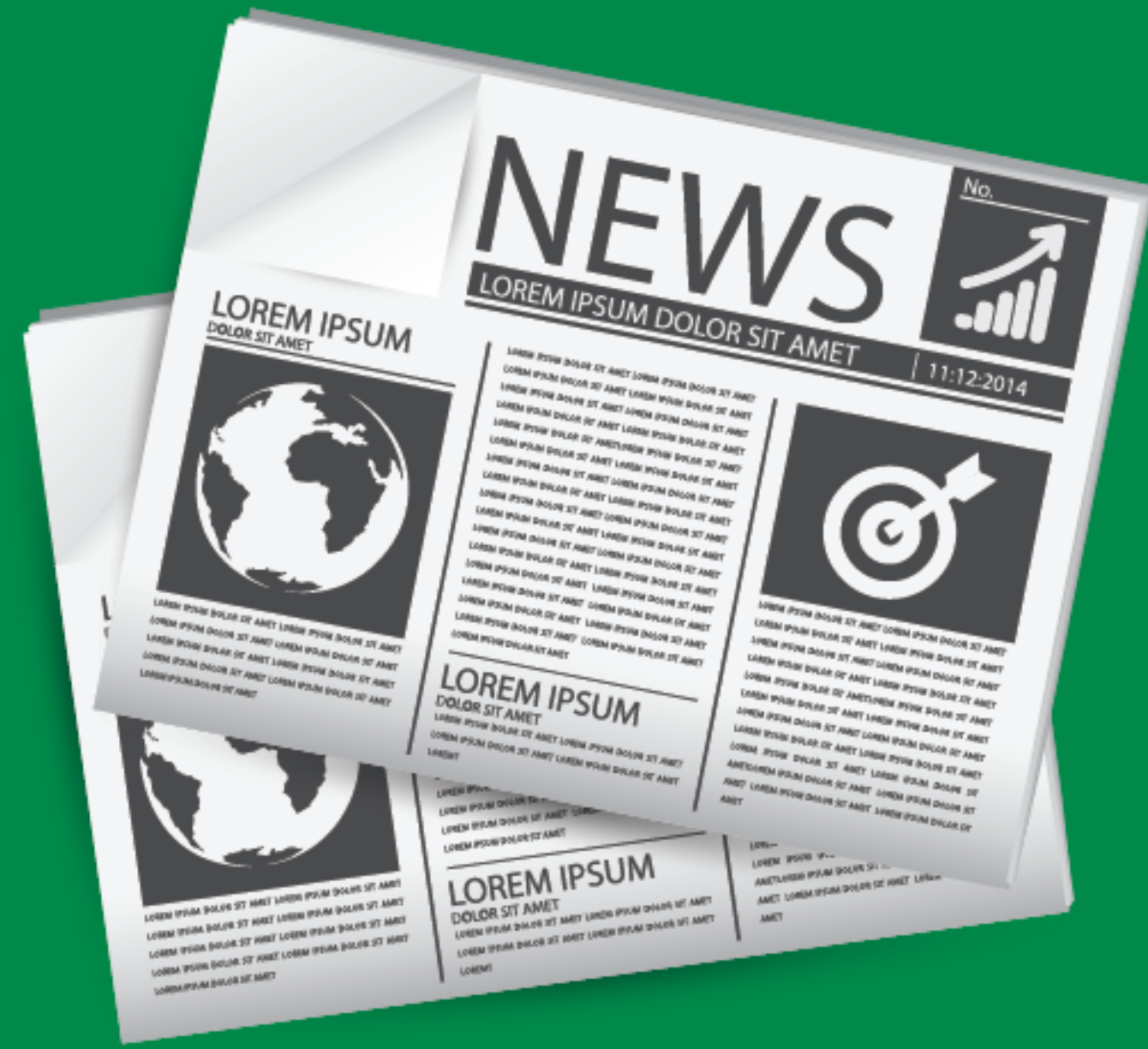
Newspapers & Magazines