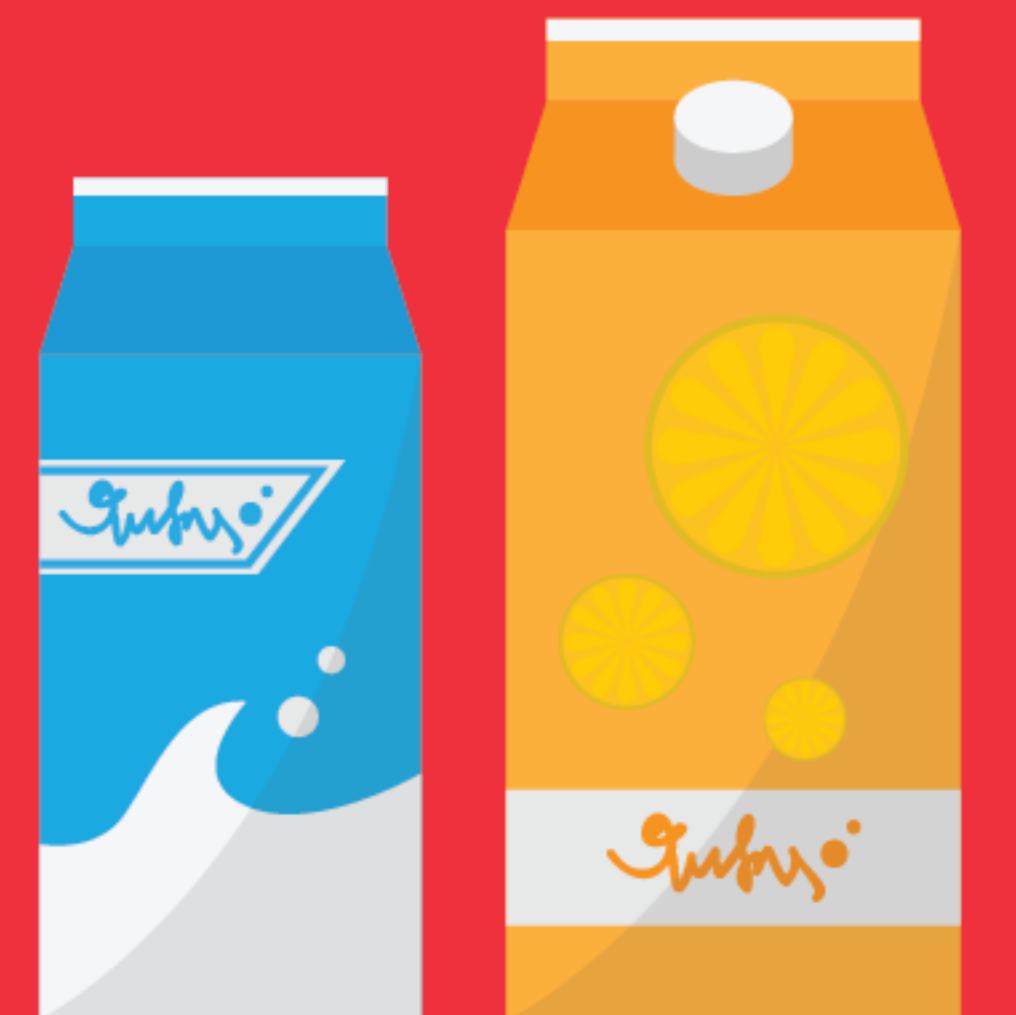
Juice & Milk Cartons