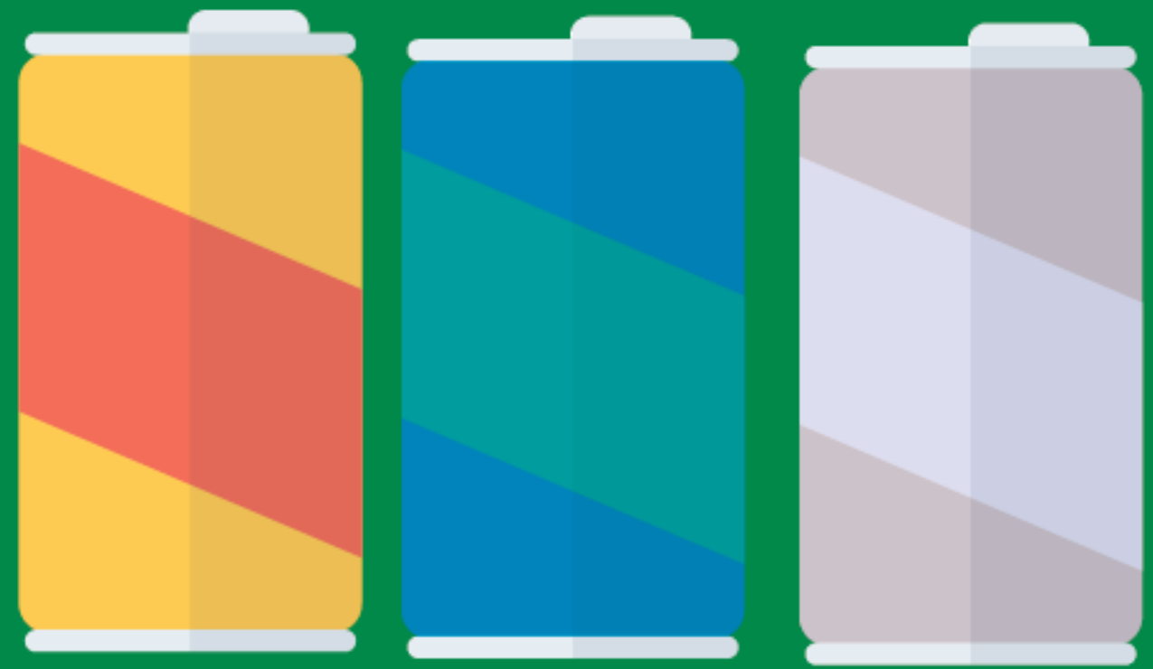
Aluminum & Steel Cans