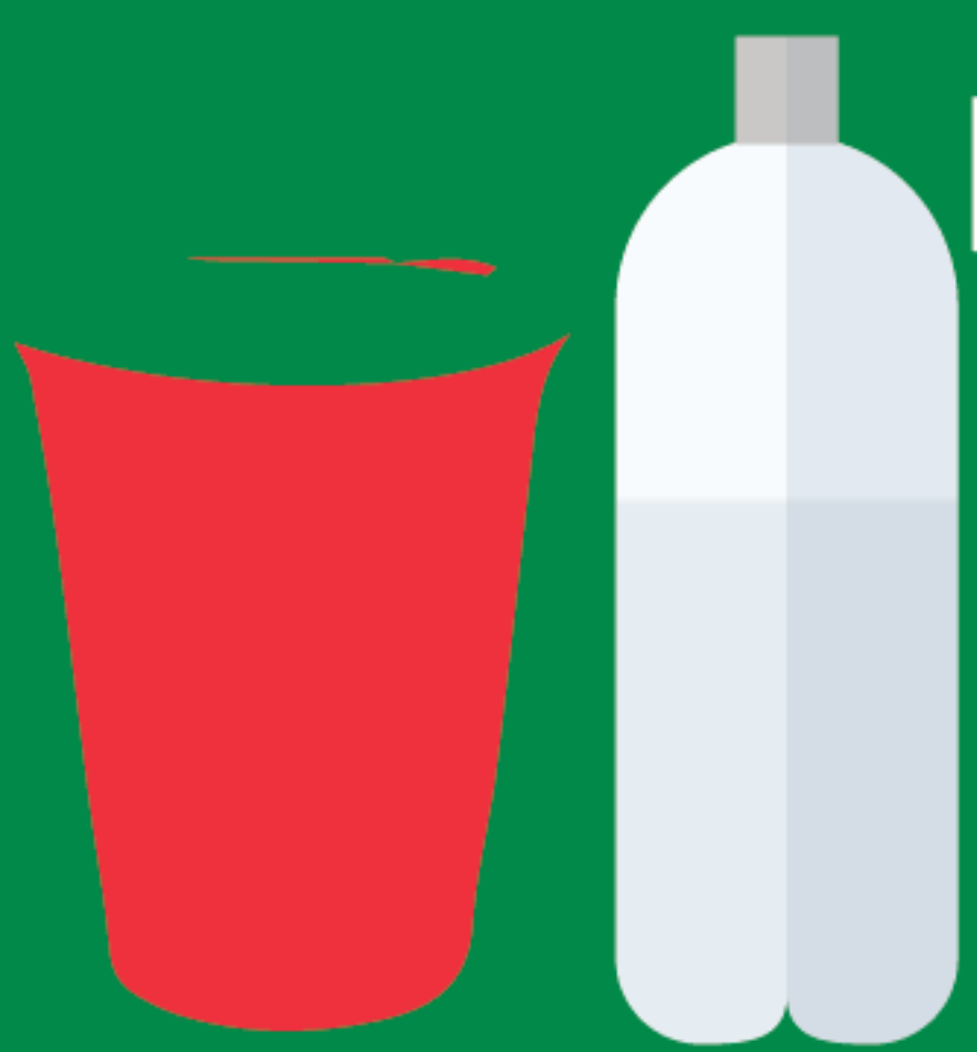
Plastic Bottles, Cups & Jugs