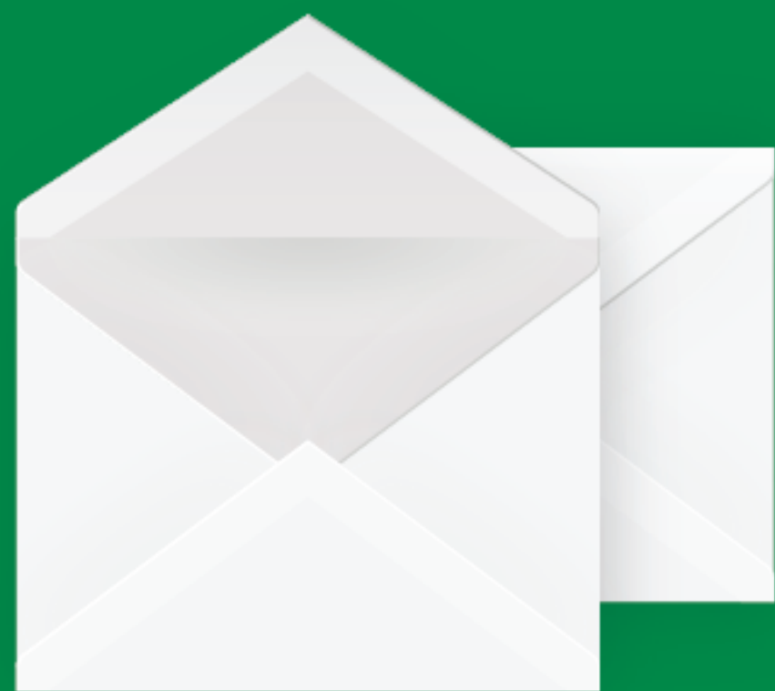
Envelopes & Junk Mail