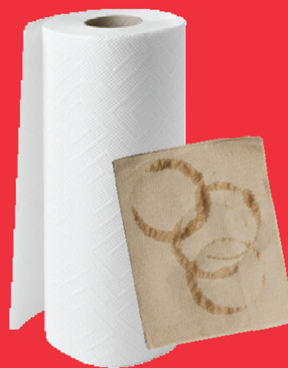
Paper Towels & Napkins