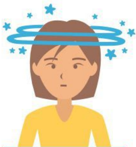
LACK OF COORDINATION