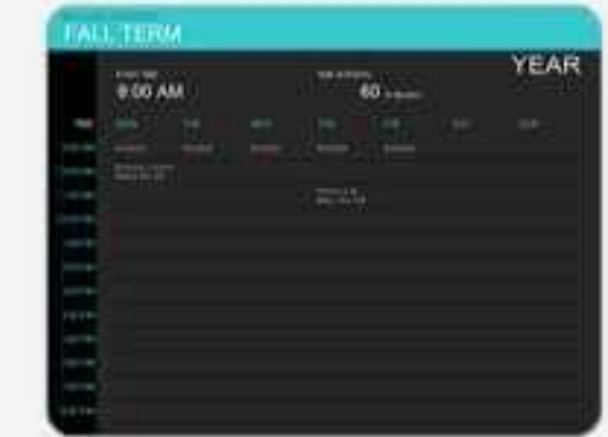
College Course Manager