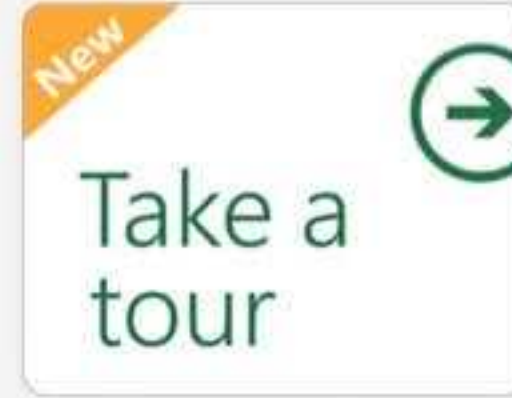
Welcome to Excel