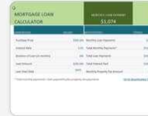
Mortgage Loan Calculator