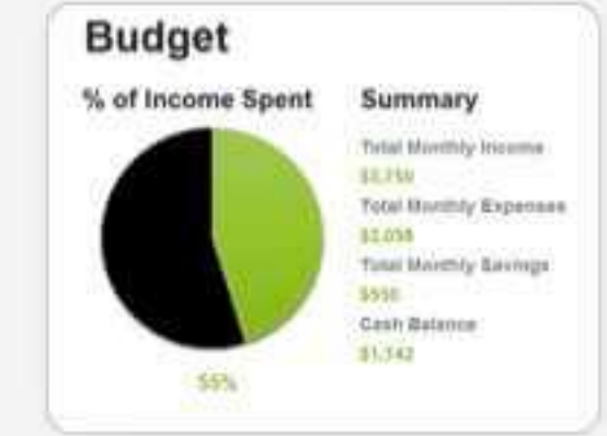
Manage My Money