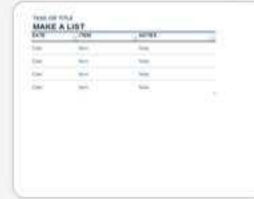
Make a List