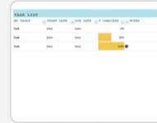
Track My Tasks