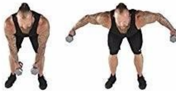
STANDING BENT-OVER FLYES