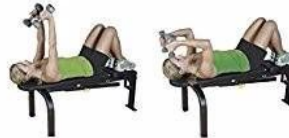
OVERHEAD TRICEPS PRESS