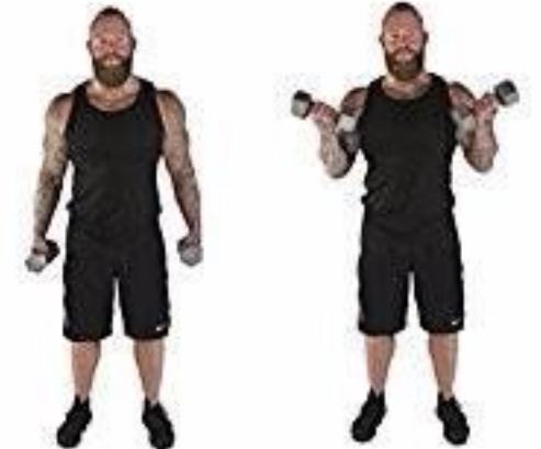
STANDING BICEP CURL