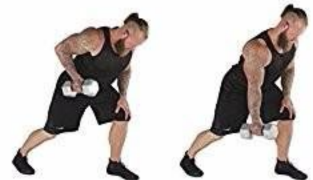
BENT OVER ROW