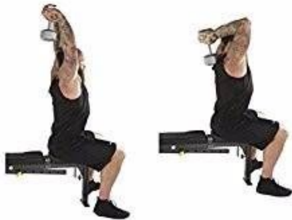
SEATED TRICEPS PRESS