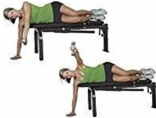
LYING SINGLE ARM FLYES