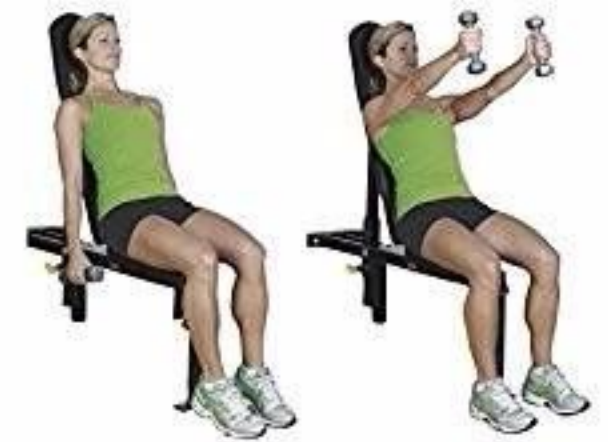
SEATED INCLINE DELTOID RAISE