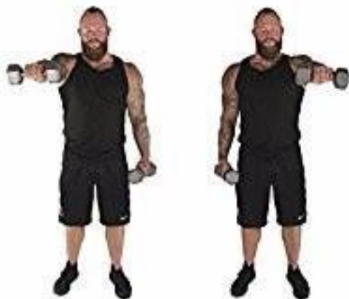
ALTERNATING FRONT DELTOID RAISE