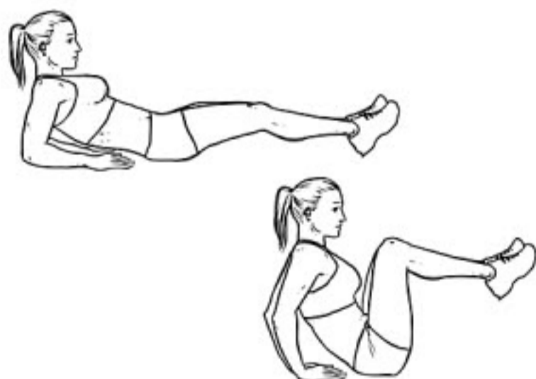
Leg Pull-In Knee-up 3 sets / 15 reps