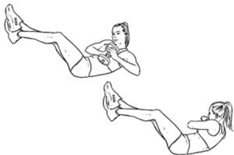
Weighted Twist 3 sets / 15 reps