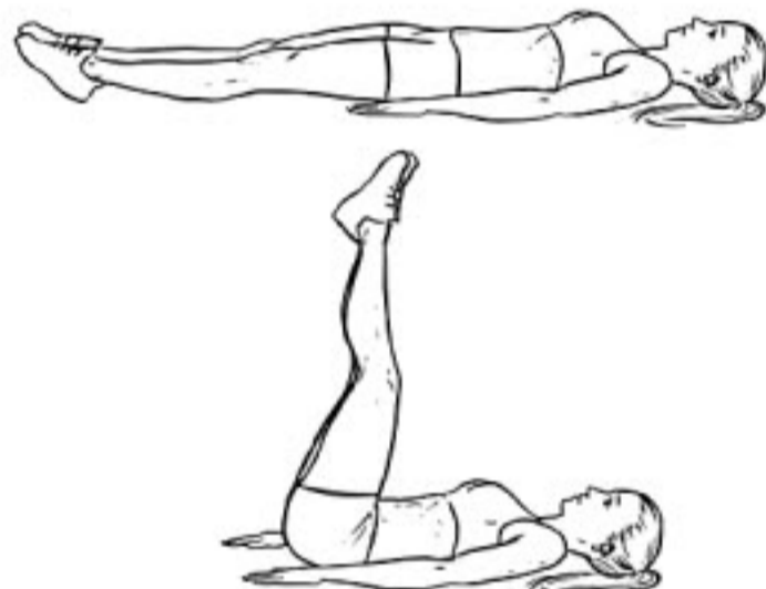
Lying Leg Raise 3 sets / 15 reps