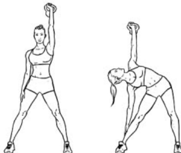
Kettlebell Windmill 3 sets / 10 reps