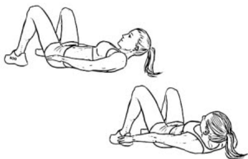
Alternate Heel Touchers 3 sets / 20 reps