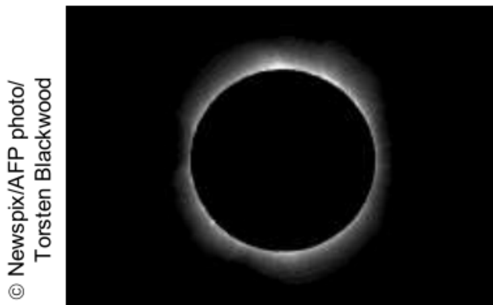
Total solar eclipse