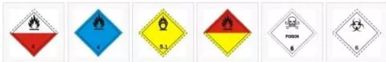
4.2-Spontaneously combustible 4.3-Dangerous when wet 5.1-Oxidizers 5.2-Organic peroxides 6.1-Poison 6.2-Infectious substances