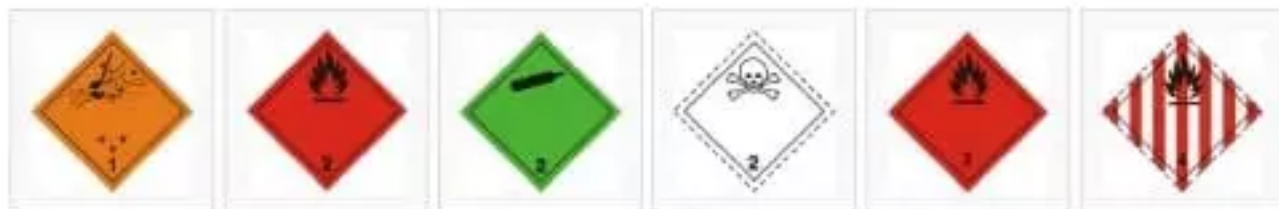
1-Explosives 2.1-Flammable gases 2.2-Non-toxic and non-flammable gases 2.3-Poison gases 3-Flammable liquids 4.1-Flammable solids