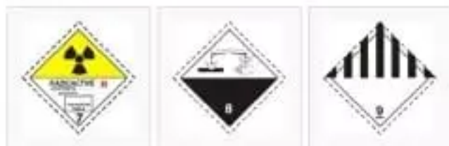
7-Radioactive 8-Corrosive 9-Miscellaneous dangerous substances